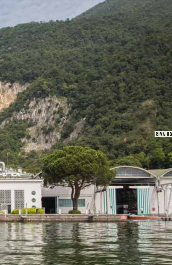
RIVA HQ, LAKE ISEO