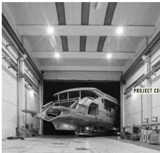
PROJECT CECILIA IN BUILD