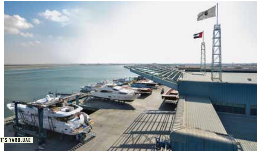
GULF CRAFT'S YARD, UAE