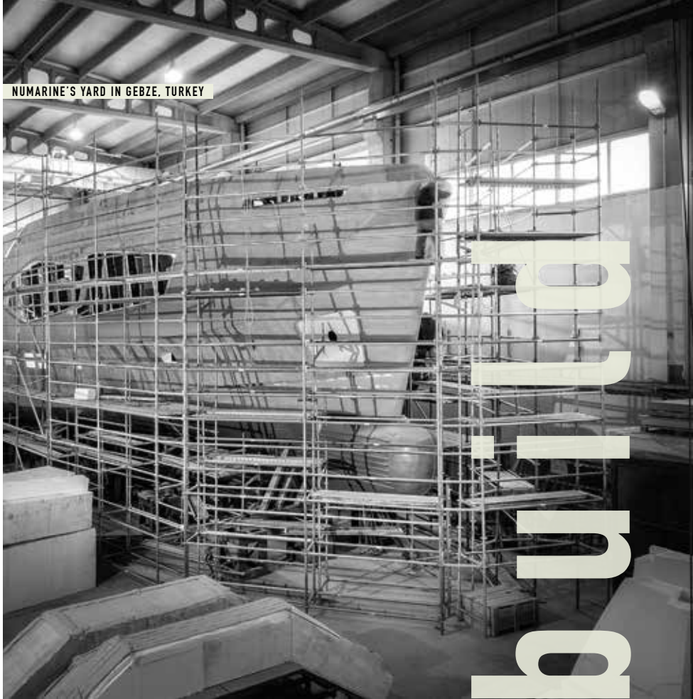
NUMARINE'S YARD IN GEBZE, TURKEY

IN BUILD 2 X 32XP, 2 X 24XP, 1 X 105 HARDTOP, 2 X 78 HARDTOP