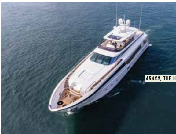
ABACO, THE HORIZON CC110