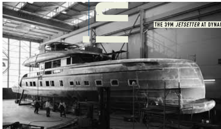
THE 39M JETSETTER AT DYNAMIQ