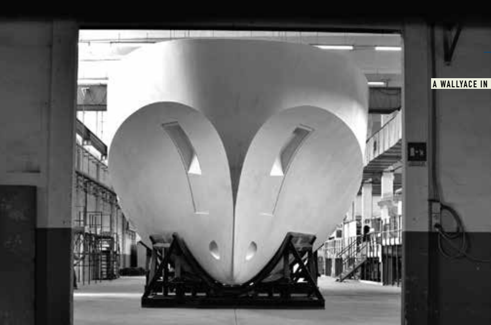
A WALLYACE IN THE WALLY SHED