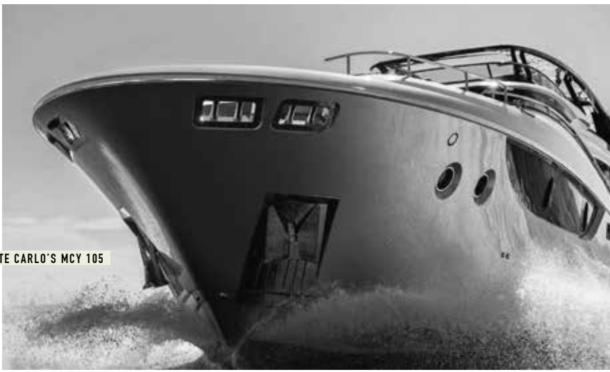
MONTE CARLO'S MCY 105