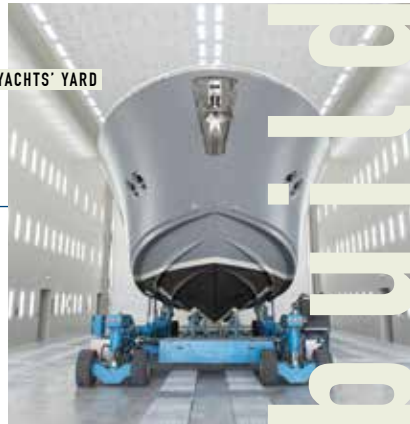
MONTE CARLO YACHTS' YARD

HOME VIAREGGIO, ITALY WEB BENETTIYACHTS.IT IN BUILD 2 X MEDITERRANEO 116', 3 X CRYSTAL 140', 1 X DELFINO 95'