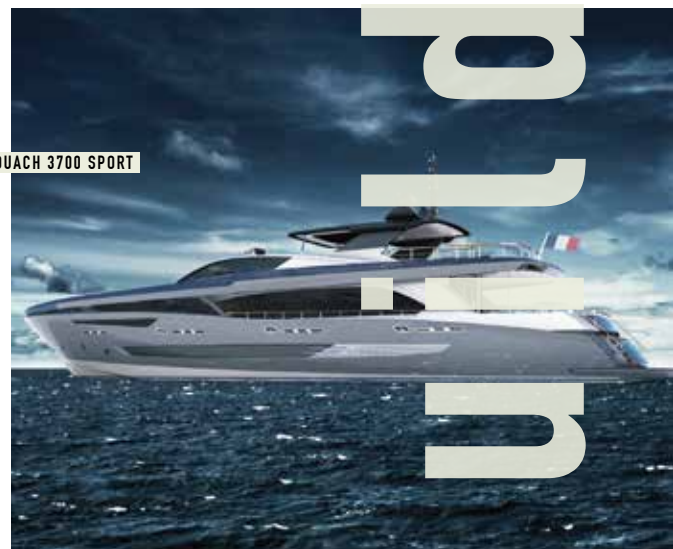
COUACH 3700 SPORT