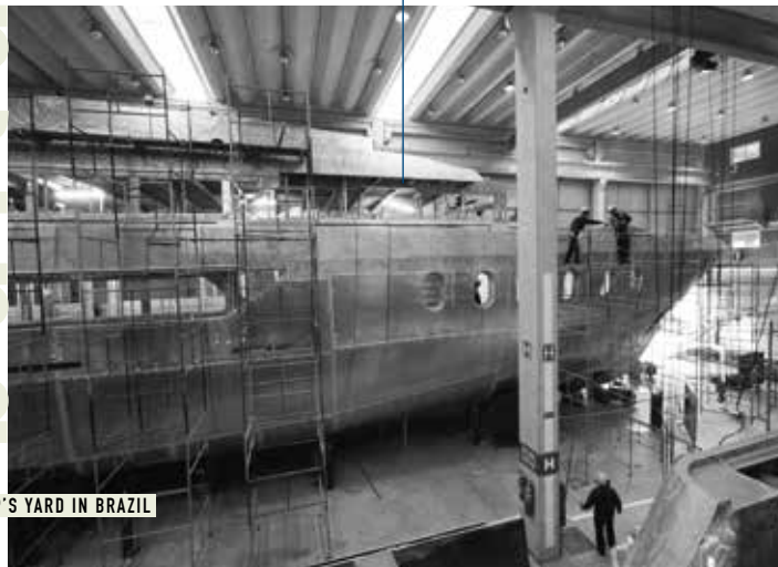
MCP'S YARD IN BRAZIL