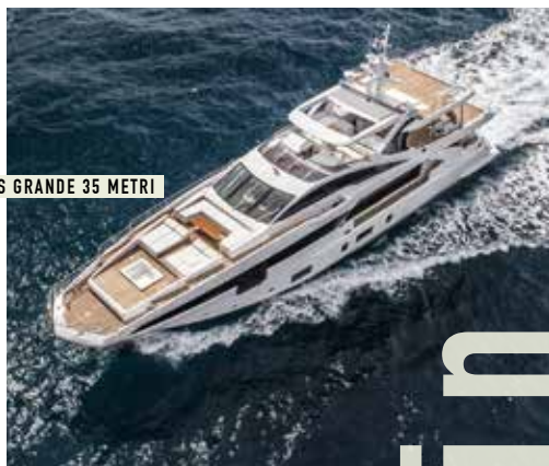
AZIMUT'S GRANDE 35 METRI